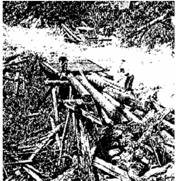
Landslides can kill people and houses trees, and