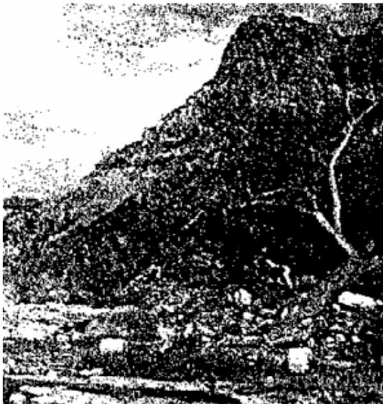
Few plants grow on eroded soil. It bury also destroys the habitat of animals

Erosion affects the land. It can change the shape and size of land.